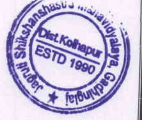
PRINCIPAL Jagruti Shikshan Shashtra Mahavidyalaya Gadhinglaj.

वरील विषयांवर सविस्तर चर्चा करण्यात आली मुख्याध्यापक तसेच इतर शिक्षक प्रतिनिधींनी आपले महत्त्वपूर्ण विचार मांडले.